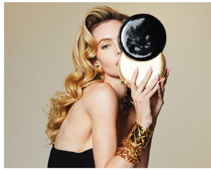
GOLDEN GIRL CHANEL Black and gold clutch CHANEL Quilted gold bracelet CHANEL Gold name plate necklare as bracelet